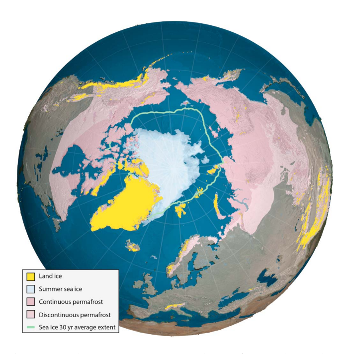
Figure 1. Land ice, summer sea ice, and permafrost in the Northern Hemisphere.

2017). The impact of permafrost thaw goes beyond the Arctic because the large amount of biomass carbon contained in permafrost is beginning to decompose and release carbon dioxide and methane to the atmosphere (Schuur et al., 2008). These added greenhouse gases further heat the atmosphere, setting up a self-reinforcing cycle, or feedback, of thawing and heating. Data analyses of permafrost soils up to 3-m depth estimate the potential carbon pool to be as much as 1,035 \pm 150 \text{ Pg} (1 Pg = 1 Gt; Hugelius et al., 2014; Schuur et al., 2015), with another 425-565 Pg C contained in permafrost deeper than 3 m (Strauss et al., 2017). This pool is climate sensitive and large; soils in all other biomes combined are thought to comprise ~2,050 Pg C in the top 3 m. The total permafrost carbon pool (1,460-1,600 Pg C) contains about twice as much carbon as the Earth's current atmosphere (Schuur et al., 2018). A release of 10% of the permafrost carbon pool as carbon dioxide and methane would be of similar magnitude as emissions from land use change (currently 1.3 \pm 0.7 Pg C/year) thereby providing a substantial contribution to future greenhouse gas release (Le Quéré et al., 2018).