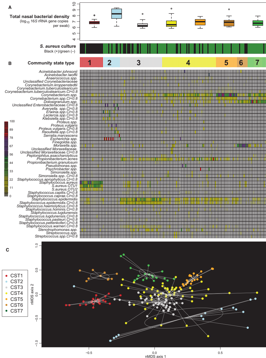
Fig. 1. The seven nasal CSTs and their respective bacterial densities shown in boxplots and composition shown in heatmap visualization and non-metric multidimensional scaling (nMDS) ordination plot. (A) In the boxplots, the box of each boxplot denotes the IQR (Q2-Q3) and the corresponding median, whereas the whiskers signify the upper and lower 1.5 \times IQR, and the open circles denote outliers beyond the whiskers. The difference in bacterial density was significantly greater across than within CSTs [analysis of variance (ANOVA), P < 0.001 ]. In particular, CST3 had significantly lower bacterial density than all other CSTs except CST4, and CST2 had significantly higher bacterial density than all other CSTs except CST6 (two-tailed Wilcoxon rank sum, P < 0.05 ) (A). (B) In the heatmap visualization, each participant's nasal microbiota is represented in a single column, and proportional abundance of each nasal bacterial taxon is shown by row according to the color key to the left. The nasal microbiota is grouped by CSTs, as indicated by the CST color bar above. The S. aureus culture result of each participant is noted by the green/black color bar above. (C) In the nMDS ordination plot, each participant's nasal microbiota (in proportional abundance) is represented by a single data point, and data points that are closer have a more similar composition than those that are farther apart. The centroids and 95% confidence ellipse for each CST are shown.